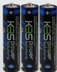
3 AA KBS Power Solutions Prime Alkaline Cells Included